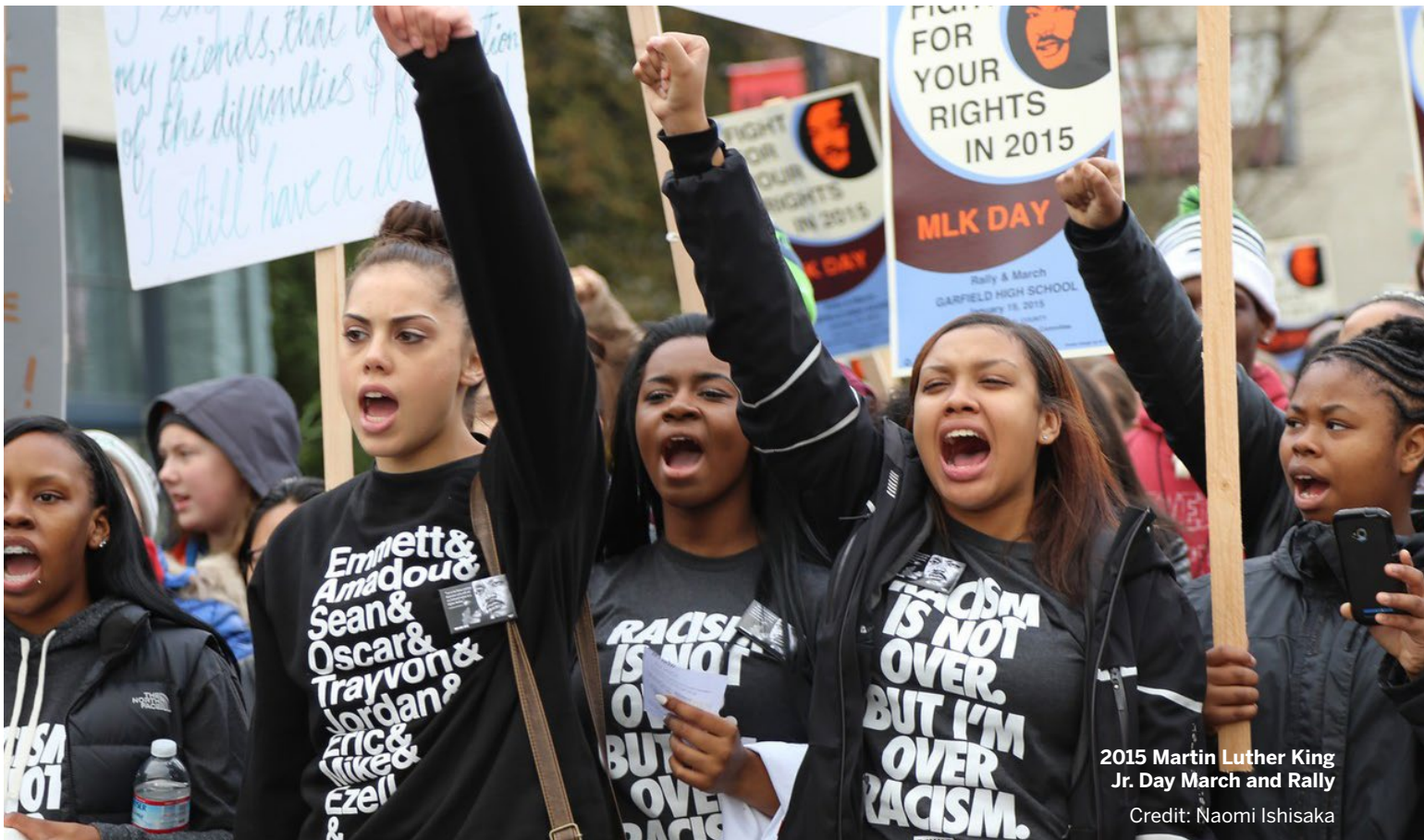
2015 Martin Luther King Jr. Day March and Rally

Today, Astraea sits at the nexus of more than 40 years of feminist grantmaking and movement building. Feminist Funding Principles is an invitation to engage in a thoughtful rigorous practice that acknowledges the power of purposeful grantmaking. These principles can be applied across different organizational strategies, geographic priorities, and theories of change. We offer them to share what we have learned over the last four decades about what it takes to support activists on the frontlines to make enduring social change.