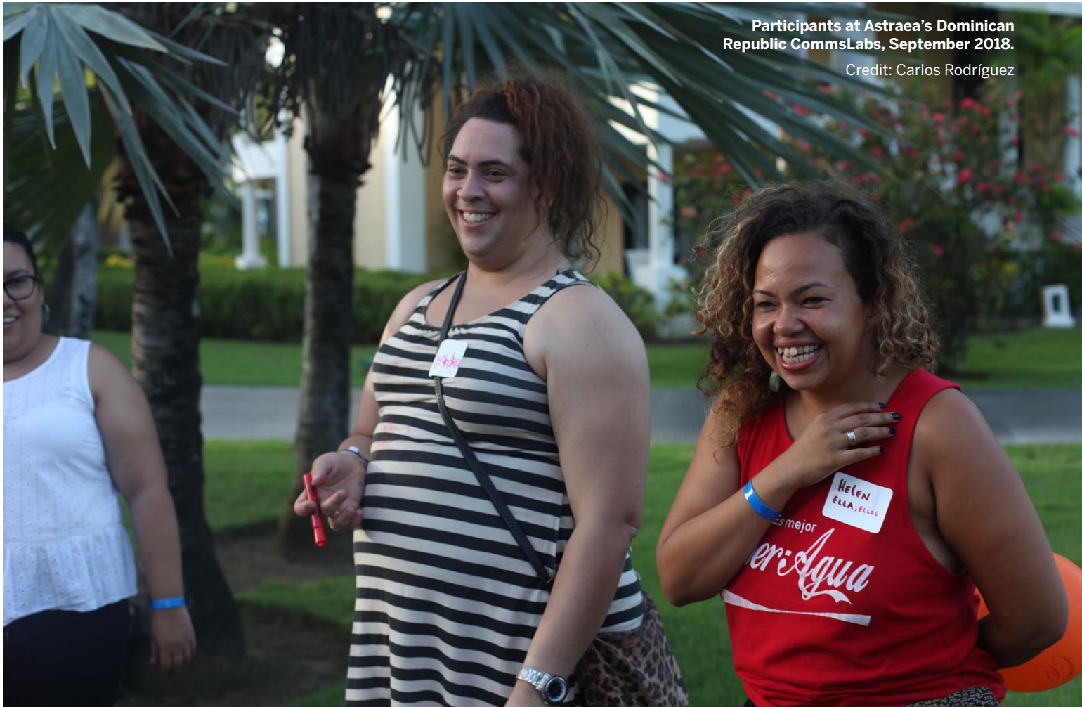
Participants at Astraea's Dominican Republic CommsLabs, September 2018.

social change possibilities also expose activists to surveillance, abuse, and harm. The Internet/digital terrain has the ability to reify oppression in ways that are not always immediately visible or obvious. Marginalized constituencies are particularly vulnerable because Internet governance policies do not prioritize their needs. It is critical to equip LBTQI and feminist activists with the skills, tools, networks, and technologies they need to harness the power of digital organizing while protecting their safety and wellbeing. There are huge opportunities for our movements to be innovative and exponentially advance their causes, if we can transcend some of the limitations and barriers they face.