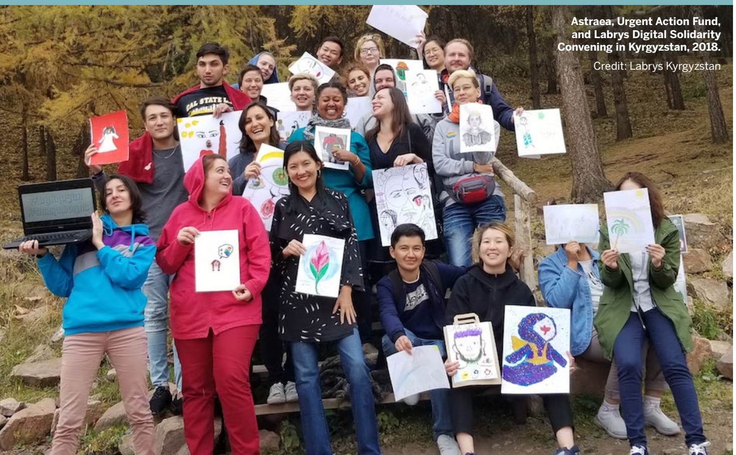
Astraea, Urgent Action Fund, and Labrys Digital Solidarity Convening in Kyrgyzstan, 2018.

In 2018, Astraea collaborated with peer funder Urgent Action Fund for Women's Human Rights and grantee partner Labrys, based in Kyrgyzstan, to host the Digital Solidarity Convening for feminist and LGBTQ activists from Post-Soviet countries in Central Asia and Eastern Europe. The convening created space for groups from across the region to explore the ways digital strategies can strengthen queer, trans, and feminist activism, while considering the implications for security and sustainability. It was a rare opportunity for activists from all over the Post-Soviet space, a deeply underfunded region, to come together. Activists discussed the political, social, and cultural challenges to organizing in the region, and strategized about the future of joint regional initiatives. The facilitators and participants noted that this kind of transnational convening was extremely critical for building trust among activists from across LGBTQI and feminist organizations, as well as for collectively responding to the violence, backlash, and oppression they face.