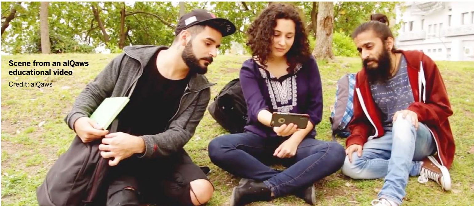
Scene from an alQaws educational video

change. For example, the fight for racial justice is deeply connected to a number of other issues, from sexual and reproductive rights to migrant justice to sex worker rights, because People of Color are disproportionately affected by health, immigration, labor, and criminal justice policies. Similarly, LGBTQI people are often the first to experience the effects of economic injustice, and the poorest communities are most negatively impacted by the fallouts of climate change. To resource movements intersectionally is to address the greatest systemic issues of injustice. It also enables communities to build power together. Funders who are willing to break down traditional identity or issue-based funding silos in order to fund across movements and communities create opportunity for the most impactful change.