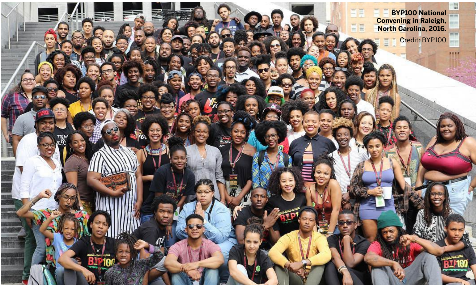
BYP100 National Convening in Raleigh, North Carolina, 2016.

As a feminist funder, we give particular attention to leadership models. Movements with intergenerational and collective leadership are far more sustainable. We encourage funders to support this practice, as well as to resource grantees' efforts to train the next generation of activist leaders through political practice and education. It is also critical to support organizations who are nurturing leadership from most-impacted communities, across gender, racial, economic, ability, and other barriers.