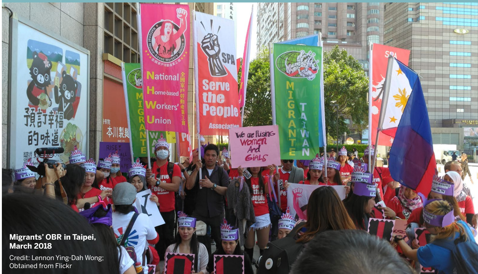
Migrants' OBR in Taipei, March 2018

One of Astraea's lesbian-led grantee partners in East Asia worked in close partnership with women's rights organizations and feminist alliances to pass the first national anti-domestic violence law in their country (anonymized for security concerns). The grantee organized with women's rights organizations to make the proposed law as inclusive as possible. In the end, they succeeded in keeping the law gender-neutral and wide enough to include protections for unmarried couples, and maintained a broad definition of domestic violence that includes psychological abuse. Each of these provisions was vital to ensure that the law would be able to be used by LGBTQI communities to secure services and protections from family violence and intimate partner violence. Overall, their advocacy contributed to a more progressive law that provides more expansive protections to more women.